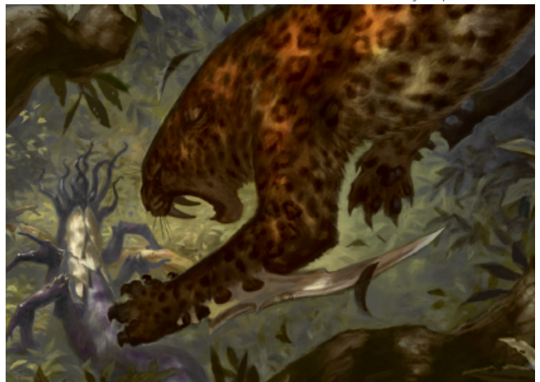
Scythe Leopard ▶ Winona Nelson

Timbermaws dwell in the hollow trunks of strange floating trees, emerging with deadly speed when prey wanders near. (The grick statistics can represent a timbermaw, adjusting its stone camouflage trait to hide it in the woodlands.) And at least two varieties of great cat (similar to the saber-toothed tiger ) sport enormous blades jutting back from the forelegs, which help them cut through heavy undergrowth and take down much larger prey.