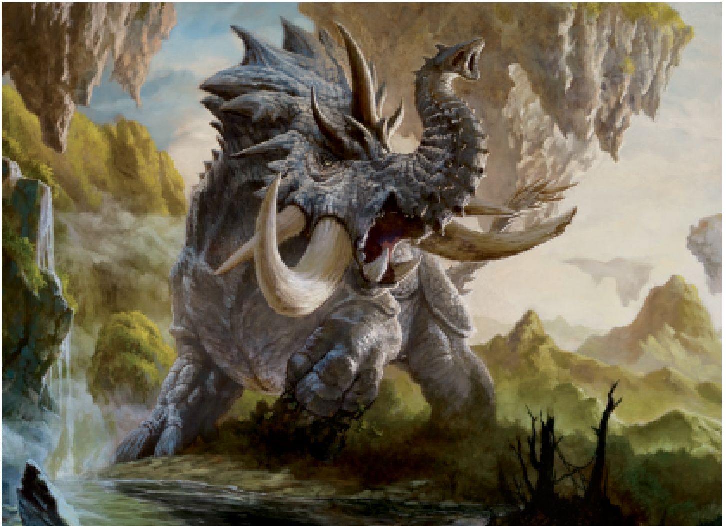
Terastodon ▶ Lars Grant-West